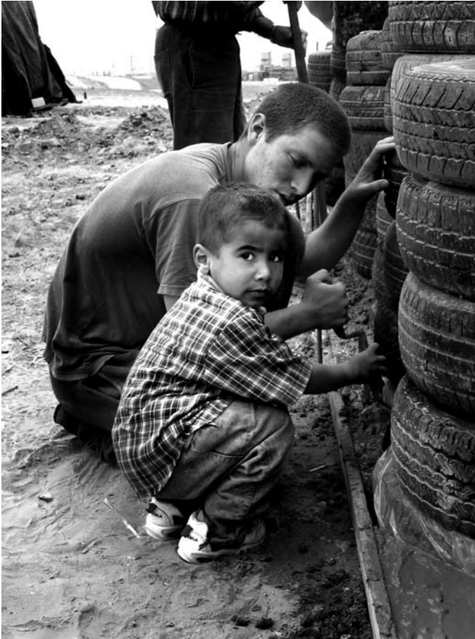
CENTER FOR CREATIVE ECOLOGY, KIBBUTZ LOTAN