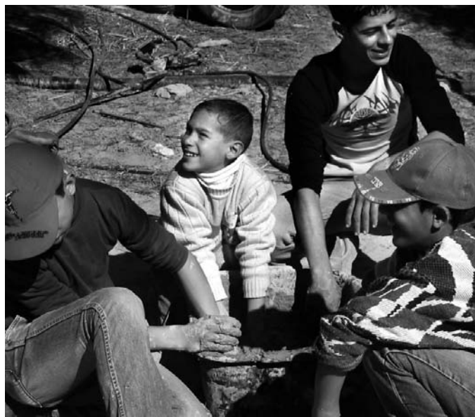
CENTER FOR CREATIVE ECOLOGY, KIBBUTZ LOTAN

Working with Bustan, we have held a series of “Building with Earth” workshops on our kibbutz for the Bedouin of the Wadi el Na’am, a village not recognized by the Israeli government, and which is situated in a polluted area south of Beersheba in the northern Negev desert. These seminars take place in the context of a supportive Jewish community—and the kibbutz experience is an eye-opener for the Bedouin. The learning seminars here are a first step. Bustan offers the next step, by helping the Bedouin identify their needs. In this case, members of Wadi el Na’am felt they needed a clinic in the village. Kibbutz Lotan