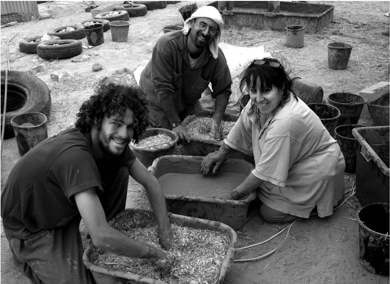
CENTER FOR CREATIVE ECOLOGY, KIBBUTZ LOTAN